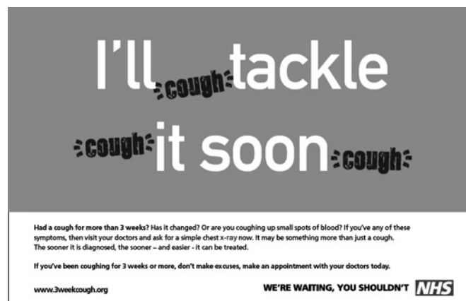
Figure 1 A poster used on billboards and in the local press.

Following on from the campaign, its impact on secondary care services and lung cancer diagnosis rates was examined.